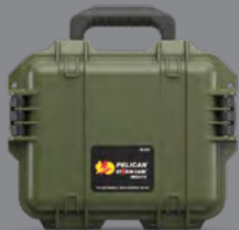
STORM CASE™ PRODUCTS