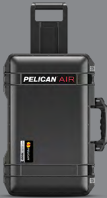
PELICAN™ AIR CASES