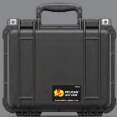
PROTECTOR CASE™ PRODUCTS