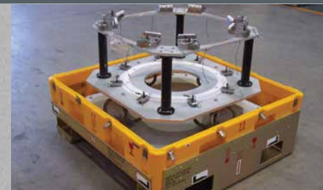
ENGINE COMPRESSOR MODULE