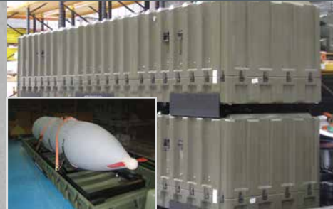
AIR TO AIR REFUELING POD