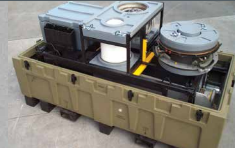
C130 PROPELLER EXCHANGE KIT