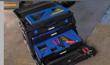
PORTABLE MECHANICS TOOL KIT