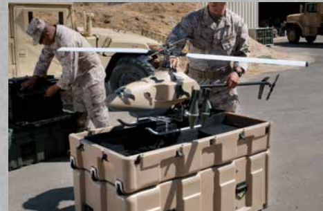
UNMANNED AIRCRAFT VEHICLE

OVER 50 YEARS OF EXTREME APPLICATIONS HAVE FORGED OUR TECHNICAL EXPERTISE