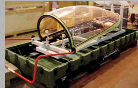
AIRCRAFT CANOPY DECK