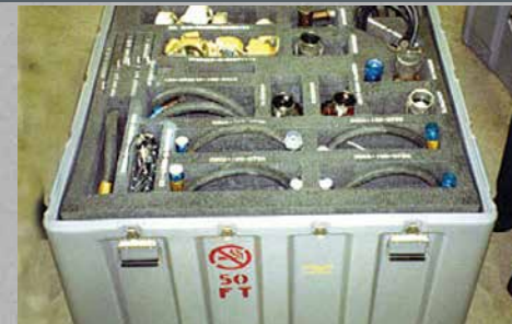
AIRCRAFT TEST TOOL KIT