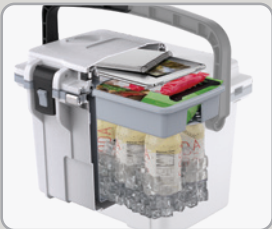
INJECTION MOLDED/ PU FOAM INSULATED