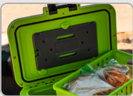
INTEGRATED, REMOVABLE ICE PACK