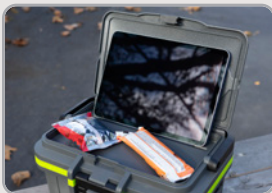
TABLET/PHONE EASEL SLOT