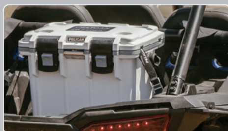
TIE-DOWN KIT FITS ALL PELICAN ELITE COOLERS