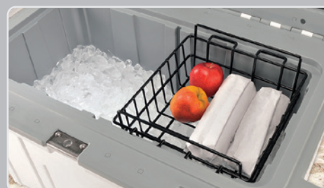
DRY RACK BASKETS FITS: 30, 50, 70, 80, 95, 150, 250QT