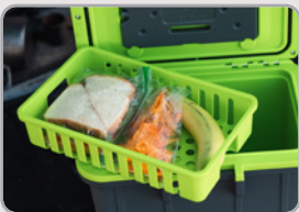
REMOVABLE INNER TRAY