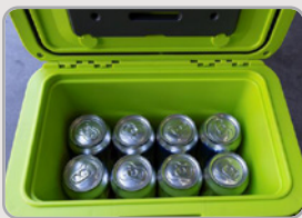
CAPACITY FOR 6-8 CANS