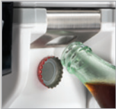
BOTTLE OPENER WITH MAGNET