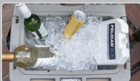
ICE PACKS THREE SIZES 1, 2, AND 5LB