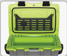
SNAP IN, FLEXIBLE LID ORGANIZER