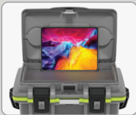
TABLET/PHONE EASEL SLOT