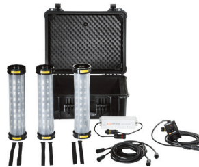
9500 SHELTER LIGHTING