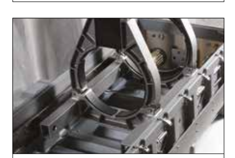
SHOCK MOUNTED SOLUTION FOR UAV