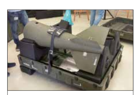
WEAPON GUIDANCE KIT