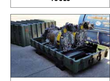
TURBO ENGINE PT6