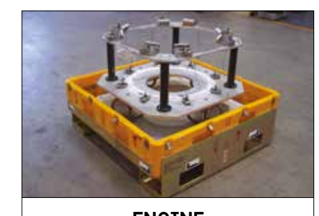
ENGINE COMPRESSOR MODULE