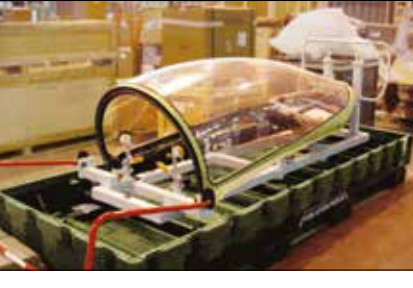
AIRCRAFT CANOPY DECK