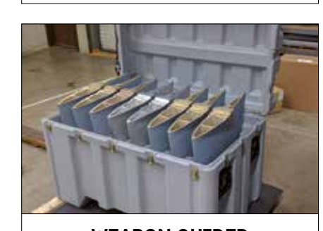
WEAPON GUIDED FINS