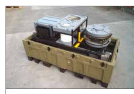
C130 PROPELLER EXCHANGE KIT