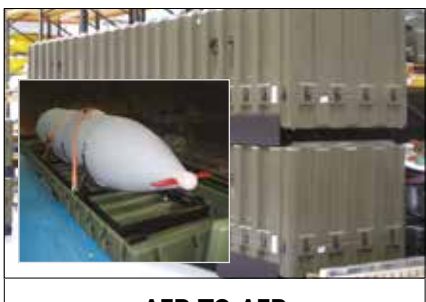
AIR TO AIR REFUELING POD