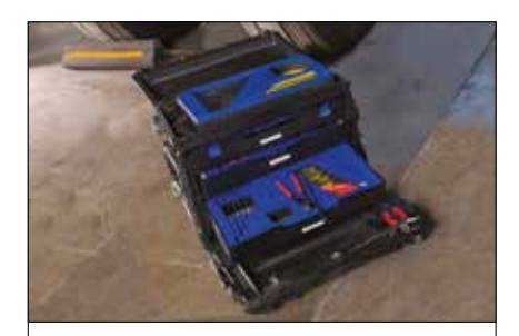
PORTABLE MECHANICS TOOL KIT