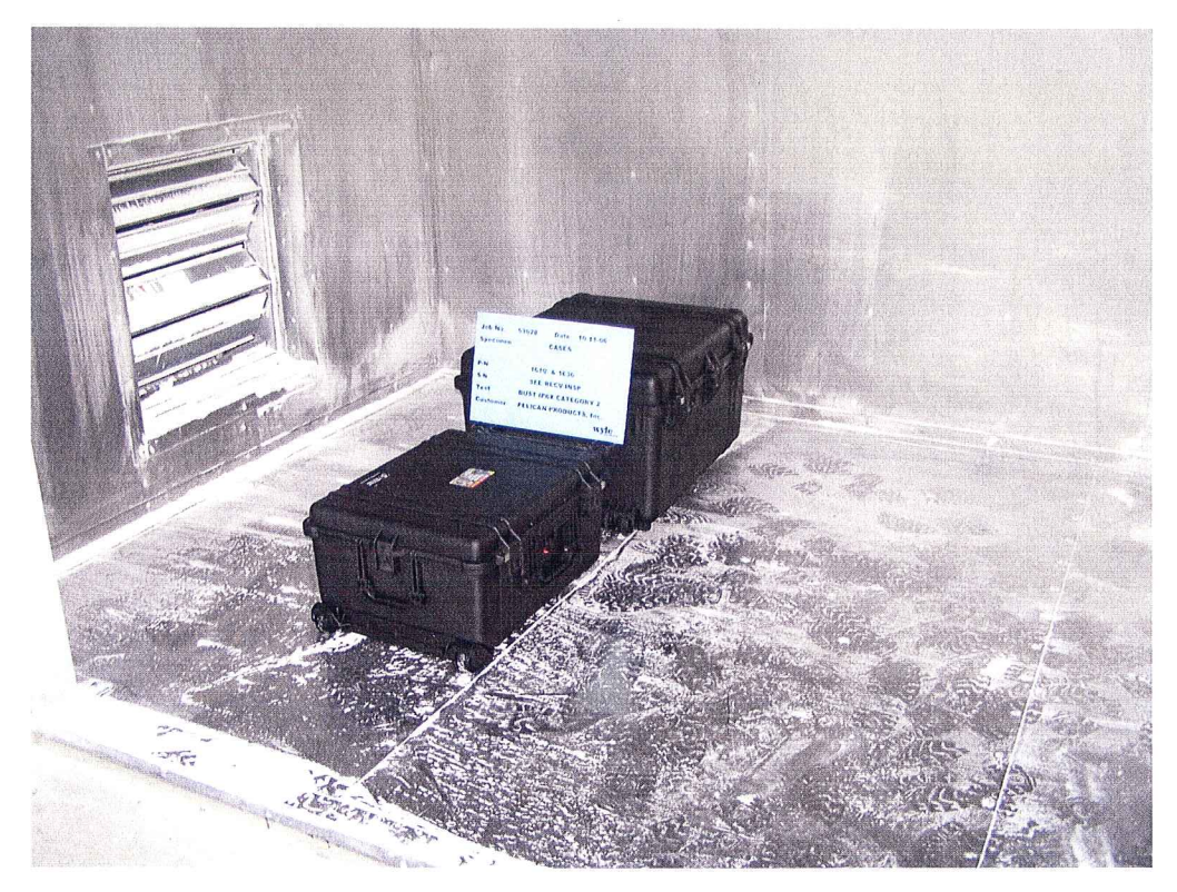
Photograph 1 Dust Test Setup (Tested with other Pelican Product Items)