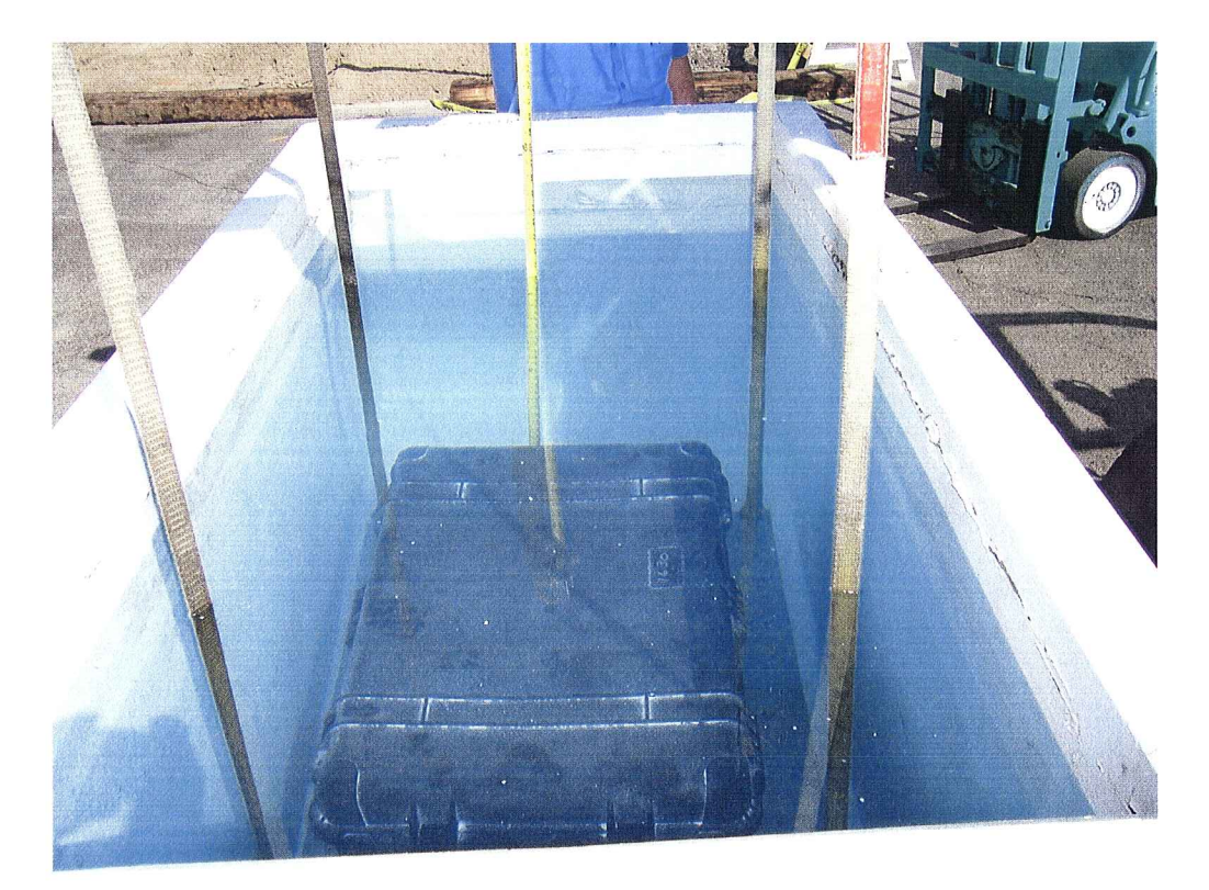
Photograph 3 Immersion Test Setup