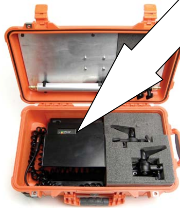
Open View of 9450